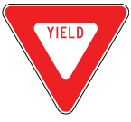
R1-2 18"x18"x18" 30"x30"x30"