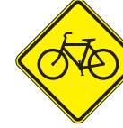
W11-1 18"x18" 24"x24"