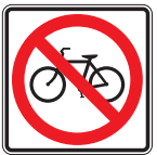
R5-6 18"x18" 24"x24"