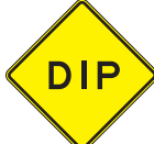
W8-2 18"x18" 24"x24"