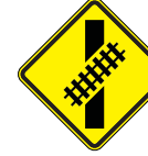
W10-12 18"x18" 36"x36"