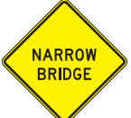
W5-2 18"x18" 30"x30"