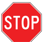
R1-1 18"x18" 30"x30"