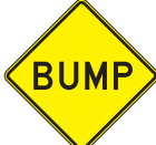
W8-1 18"x18" 24"x24"