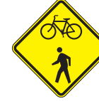
W11-15 18"x18" 30"x30"