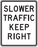
R4-3 12"x18" 18"x24"