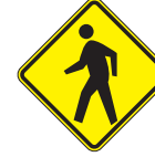
W11-2 18"x18" 24"x24"