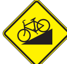
W7-5 18"x18" 30"x30"