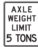
R12-2 24"x30" 36"x48"