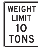
R12-1 24"x30" 36"x48"