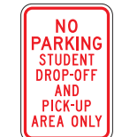
Student Lane Option 12"x18" 18"x24"