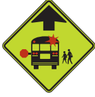
S3-1 30"x30" 36"x36" 48"x48"