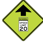
S4-5 30"x30" 36"x36" 48"x48"