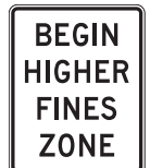
R2-10 24"x30" 36"x48"