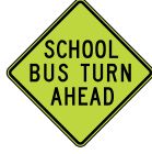
S3-2 30"x30" 36"x36" 48"x48"