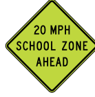
S4-5a 30"x30" 36"x36" 48"x48"