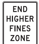
R2-11 24"x30" 36"x48"