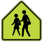
S1-1 30"x30" 36"x36" 48"x48"

Fluorescent Yellow Green is now required for all School Warning Signs.