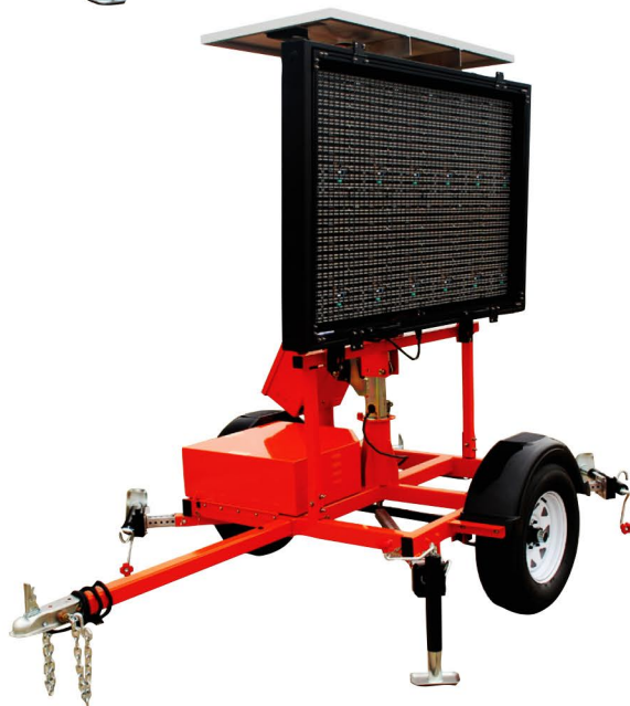
THE SMC 5000 SHOWN IN TRAVEL POSITION