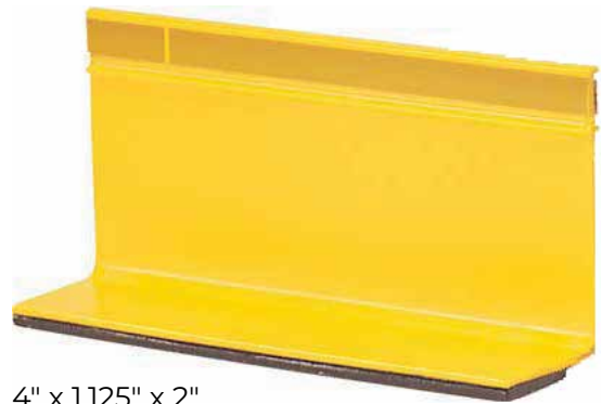
4" x 1.125" x 2"